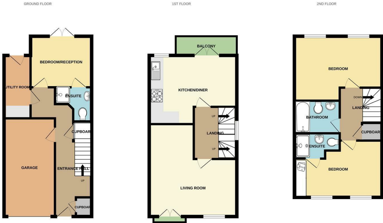
2 WHARTON CRESCENT, BEESTON

Whilst every attempt has been made to ensure the accuracy of the floorplan contained here, measurements of doors, windows, rooms and any other items are approximate and no responsibility is taken for any error, omission or mis-statement. This plan is for illustrative purposes only and should be used as such by any prospective purchaser. The services, systems and appliances shown have not been tested and no guarantee as to their operability or efficiency can be given. Made with Metropix ©2023